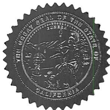
DEBRA BOWEN Secretary of State

A handwritten signature in black ink that reads "Debra Bowen". The signature is written in a cursive style.