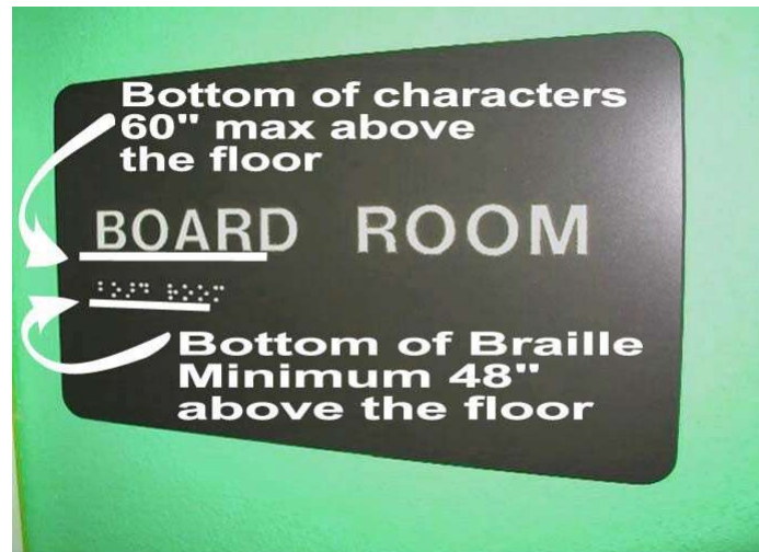
Figure 20: Mounting height for Braille and Raised Characters.

Tactile characters on signs shall be placed so the lowest part of any Braille cell is 48 inches or higher above the floor and the bottom of any tactile letter is no more than 60 inches above the floor measured from the baseline of raised characters. (CCR, Sections 11B-703.4.1 and 11B-703.4.2.) See Figure 20.