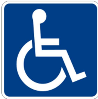
Figure 16: International Symbol of Accessibility (ISA)

The standard symbol used to identify facilities and features that are accessible to elderly voters and persons with disabilities is the International Symbol of Accessibility (ISA). The ISA used by county elections officials consists of a white figure on a blue background. (CCR, Section 11B-703.7.2.1.) See Figure 16.