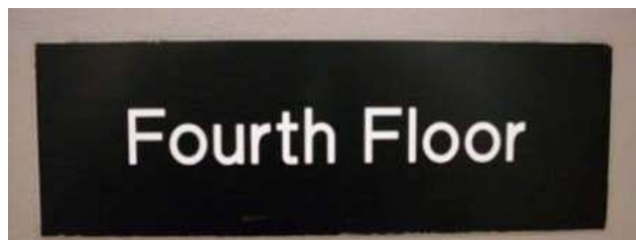
Figure 17: Accessible sign showing light characters on a dark background.

Accessible signs shall also have character and symbol colors that contrast with the background color. (Dark on a light background or light on a dark background.) (CCR, Sections 11B-703.5.1 and 11B-703.7.1.) See Figure 17.