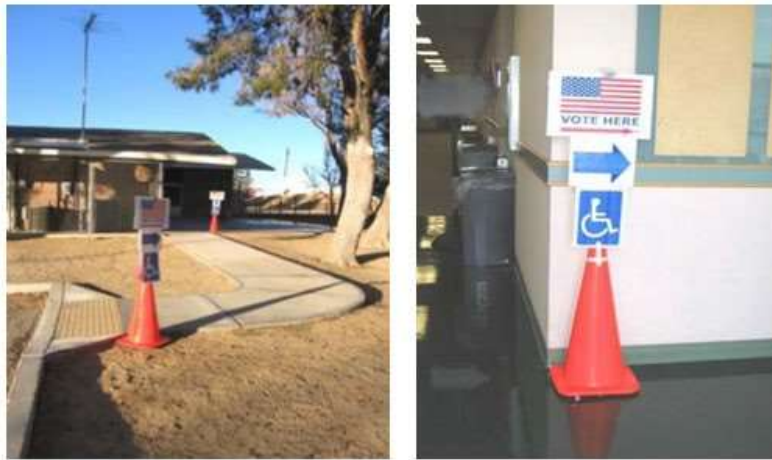
Figure 18: Accessible directional signage indicating the route to the accessible polling place entrance.

At polling sites where not all entrances are accessible, those entrances that comply with these guidelines shall be identified with an ISA. Entrances which are not accessible on Election Day shall have directional signage that indicates the route to the nearest accessible entrance. Directional signs must be placed at the inaccessible entrance or at the junction where the accessible route diverges from the non-accessible route. (CCR, Section 11B-216.6.) Directional signs shall have contrasting colors and non-glare finish (CCR, Sections 11B-216.6 and 11B-703.5.1.) Directional and informational signs do not require raised letters and Braille. See Figure 18.