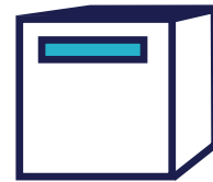
Vote-By-Mail Ballot Drop Box Location

The information below will help you make an initial determination if your facility is the right fit to be a potential Voting Location or a vote-by-mail ballot drop box location.