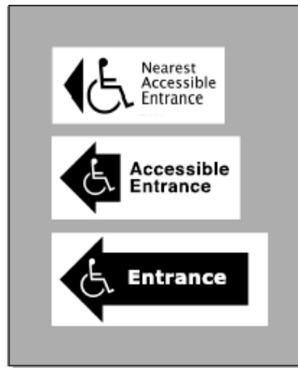
Figure 6: ISA signs directing individuals to the accessible route to a polling place.

Occasionally there is more than one circulation path to the polling place but only one is accessible. Signs that meet the requirements of Section 5 of these Guidelines shall be used to direct elderly voters and voters with disabilities to the accessible route. (CCR, Section 11B-216.6.) See Figure 6.