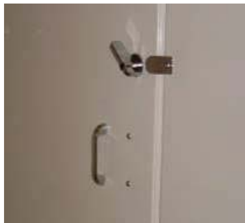
Figure 34: Restroom door with an accessible handle and flip over style hardware.

The latch hardware on the stall door shall be a flip-over style, sliding or similar hardware that does not require the user to grasp, pinch or twist their wrist. Accessible handles shall be placed near the latch on both the inside and outside of the stall door. (CCR, Section 11B-604.8.1.2 Exception.) See Figure 34.