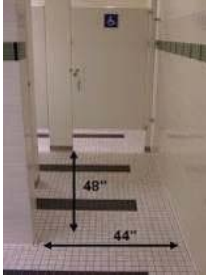
Figure 35: Restroom clear floor space on the accessible route to the toilet stall.

Accessible compartment stalls shall be 60 inches wide minimum, measured perpendicular to the side wall, and 56 inches deep minimum for wall-hung water closets (toilets) and 59 inches deep minimum for floor-mounted water closets (toilets) measured perpendicular to the rear wall. (CCR, Section 11B-604.8.1.1.)