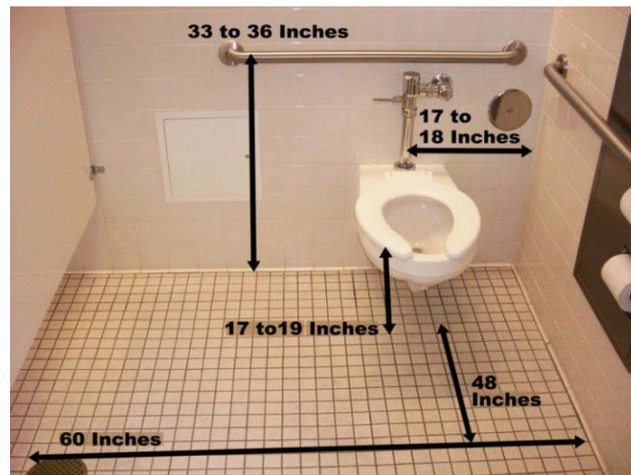
Figure 36: Clear floor space, toilet, and grab bar measurements inside a restroom stall.

Rear grab bars shall be a minimum of 36 inches long, extend from the centerline of the toilet 12 inches minimum toward the narrow side, and 24 inches minimum toward the wide side. (CCR, Section 11B-604.5.2.) See Figure 36. Rear grab bars are allowed to be 24 inches long, extending 12 inches on each side of the centerline of the toilet, when a recessed fixture is mounted on the rear wall adjacent to the toilet. (CCR, Section 11B-604.5.2. Exception 1.)