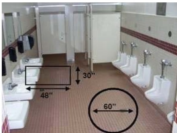
Figure 32: The inside of a restroom showing floor space measurements.

An unobstructed turning space 27 inches high and at least 60 inches in diameter or a T-shaped turning space is required inside the restroom for voters who use wheelchairs. No door may swing into this space more than 12 inches except the door to the accessible toilet compartment. (CCR, Section 11B-603.2.1.) See Figure 32.