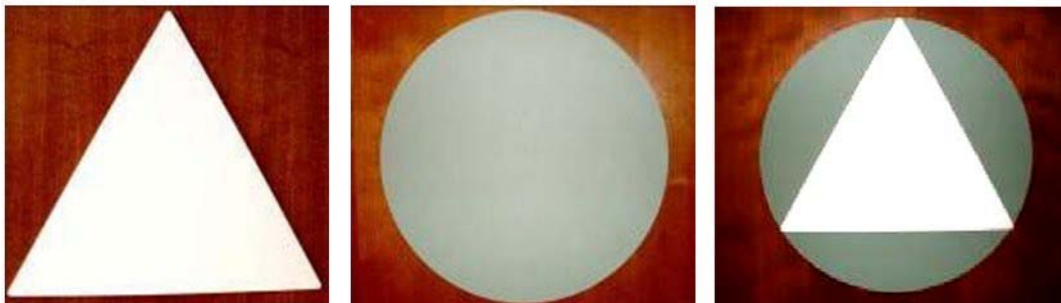
Figure 31: Geometric signs for Men, Women and Unisex restrooms.

The second set of signs are required symbols for Men's, Women's, and Unisex restrooms. The Men's restroom sign is identified by an equilateral triangle with edges 12 inches long and the apex pointing upward. The Women's restroom sign is a circle 12 inches in diameter. The Unisex sign is a circle 12 inches in diameter with a triangle placed over the circle within the 12-inch diameter. The circle and triangle must have contrasting colors. These geometric signs shall be mounted at 58 inches minimum and 60 inches maximum above the floor or ground surface measured from the centerline of the sign. The color shall contrast distinctly from the color of the background. (CCR, Section 11B-703.7.2.6.) See Figure 31.